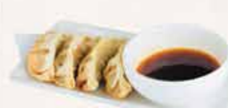
Chicken Gyoza £6 • £4 HH