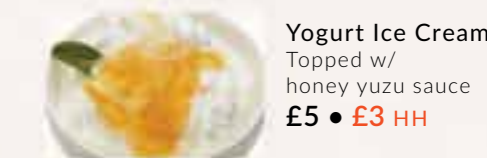
Yogurt Ice Cream Topped w/ honey yuzu sauce £5 • £3 HH