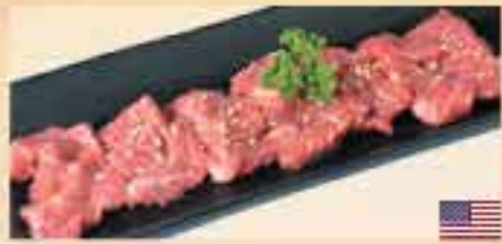
USDA Premium Flat Iron £13 • £11 HH Ponzu / Sweet Soy