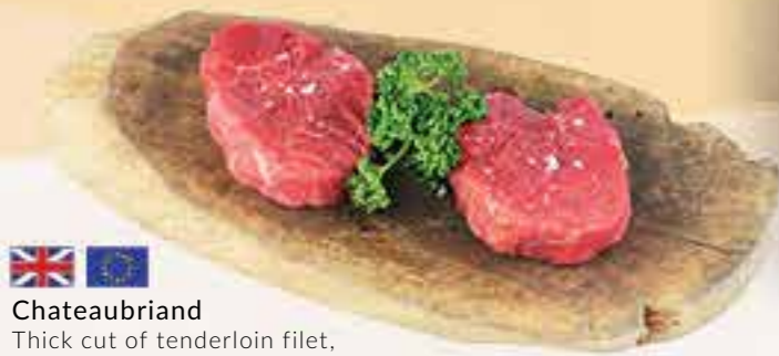
Chateaubriand Thick cut of tenderloin filet, deliciously tender and low-fat texture £27 • £22 HH Ponzu / Sweet Soy