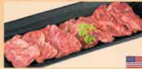
USDA Premium Harami Skirt Steak £15 • £13 HH Miso / Garlic