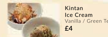
Kintan Ice Cream Vanilla / Green Tea £4