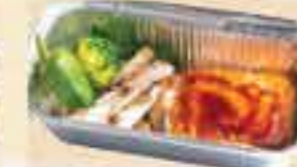
Miso Butter Salmon £7 • £5 HH