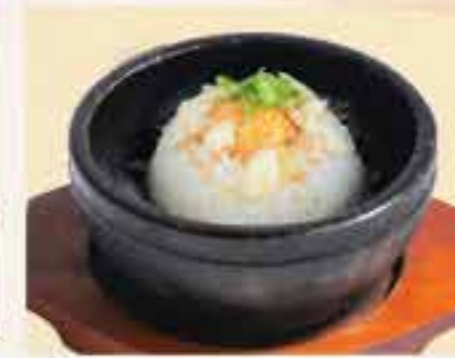
Garlic Fried Rice £9 • £7 HH