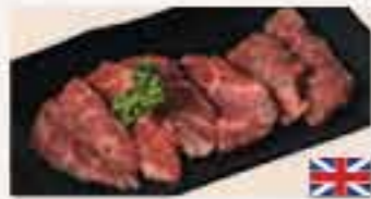
Kalbi Short Rib £10 • £8 HH Sweet Soy / Shio