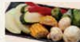
Assorted Vegetables £8 • £6 HH