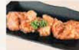
Chicken Teriyaki £7 • £5 HH