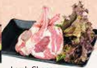
Lamb Chops £9 2pcs £17 4pcs Basil / Garlic