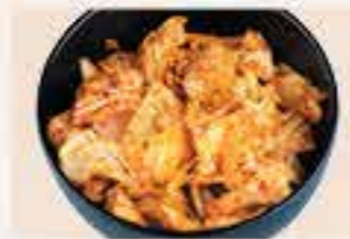
Spicy Addicting Cabbage £6 • £4 HH