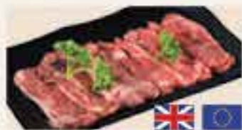
Harami Skirt Steak £9 • £7 HH Miso / Sweet Soy / Garlic