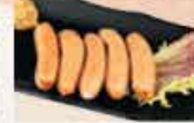
Japanese Style Sausages 5pcs £6 • £5 HH