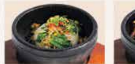
Vegetable Bibimbap £9 • £7 HH