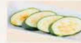
Courgette £4 • £3 HH