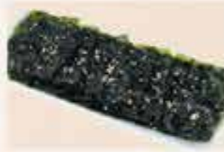
Crispy Seaweed £2 • £1 HH