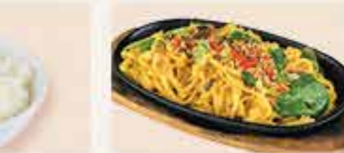
Vegetable Garlic Noodles £10