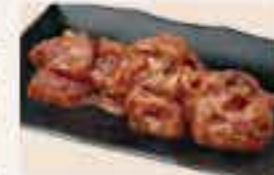
Spicy Chicken £7 • £5 HH