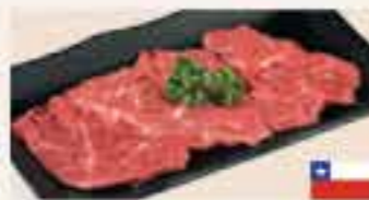
Rosu Sliced Rib Eye £9 • £7 HH Sweet Soy / Ponzu