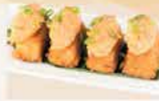
Spicy Tuna Volcano £10 • £9 HH