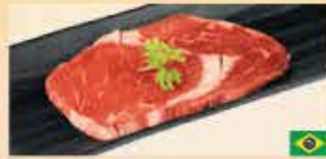
Premium Rib Eye £12 • £10 HH Sweet Soy / Ponzu