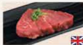
Filet Mignon £16 • £12 HH Ponzu / Sweet Soy