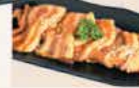
Spicy Pork £9 • £7 HH