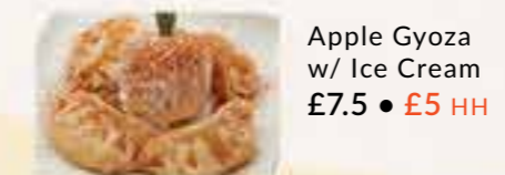
Apple Gyoza w/ Ice Cream £7.5 • £5 HH