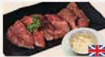
Garlic Butter Kalbi Short Rib £11 • £9 HH