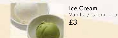
Ice Cream Vanilla / Green Tea £3