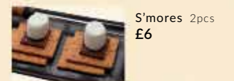
S'mores 2pcs £6