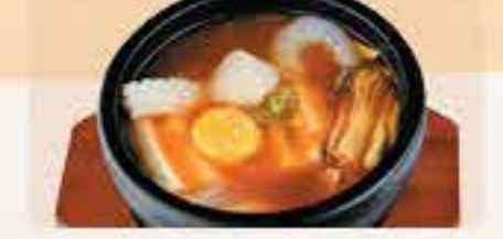
Seafood Tofu Chigae £14