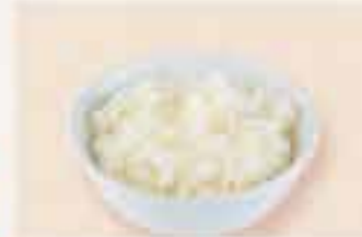
Steamed Rice £3