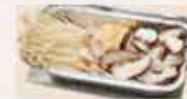
Mushroom Medley £6 • £5 HH