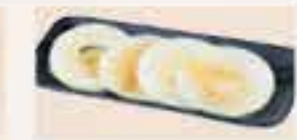
Sweet Onion £4 • £3 HH