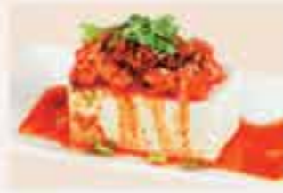
Spicy Tofu £6 • £5 HH