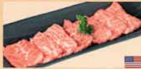
USDA Premium Kalbi Short Rib £16 • £13.5 HH Sweet Soy / Shio / Garlic

Juicy quality, tenderness, and beautiful marbling