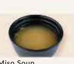
Miso Soup £3 • £2 HH