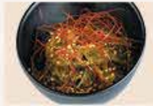
Wakame Seaweed Salad £4 • £3 HH