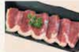
Duck Breast £9 • £8 HH Yuzu / Miso