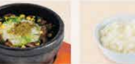
Pepper Beef Bibimbap £12 • £10 HH