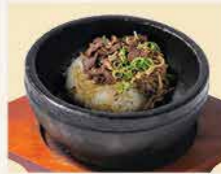
Beef Sukiyaki Bibimbap £12 • £10 HH