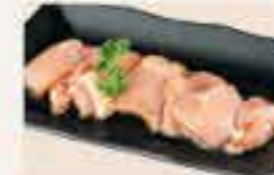
Chicken Garlic £7 • £5 HH