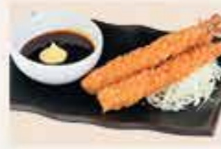
Ebi Furai £7 • £5 HH