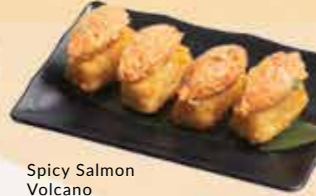
Spicy Salmon Volcano £9 • £8 HH