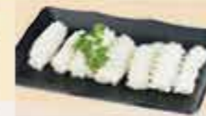
Squid £6 • £4 HH Miso / Sweet Soy & Garlic