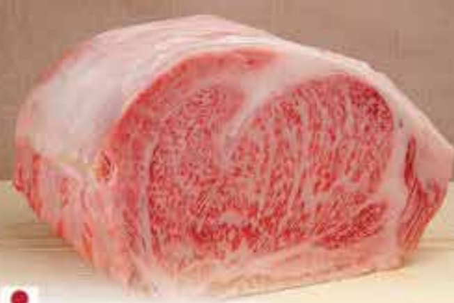
A5 Wagyu Strip Loin 250g The pinnacle of Japanese beef! Buttery marbling and incredibly rich in flavor £125