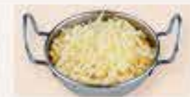
Cheese Corn £7 • £4 HH