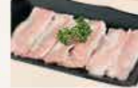
P-Toro Pork Jowl £7 • £6 HH Shio / Wasabi Soy