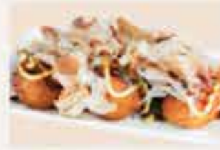
Takoyaki £6.5 • £5 HH