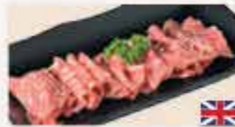
Yaki-Shabu Beef £7 • £5 HH Miso / Shio