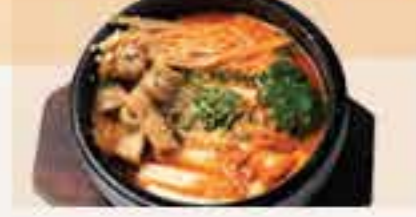
Tofu Chigae Ground Chicken / Pork / No Meat £11