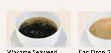
Wakame Seaweed Soup £3 • £2 HH