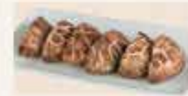
Shiitake Mushroom £5 • £4 HH