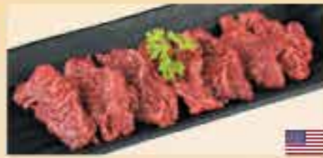
USDA Premium Bistro Hanger Steak £13 • £11 HH Miso