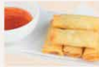
Vegetable Spring Rolls £5 • £4 HH