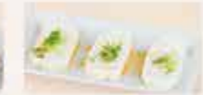
Halloumi Cheese £5 • £3 HH