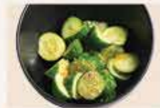
Addicting Cucumber £5 • £3 HH