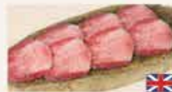
Beef Tongue £11 £12 w/ Negi Sauce