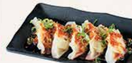
Steamed Chili Gyoza £7.5 • £6 HH