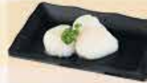
Scallops 3pcs £9 Miso / Shio