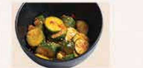
Spicy Addicting Cucumber £6 • £5 HH