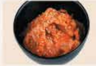
Hakusai Kimchee £4 • £3 HH