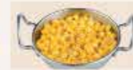
Butter Corn £6 • £3 HH