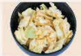
Addicting Cabbage £5 • £3 HH