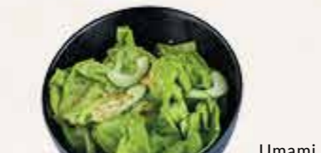
Umami Salad £5 • £4 HH