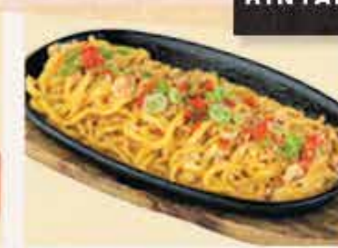
Chicken Garlic Noodles £10