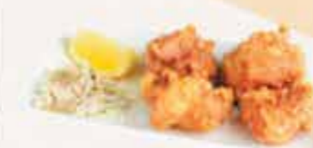
Chicken Karaage Small £7 • £5 HH Large £12 • £8 HH