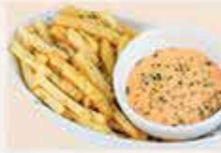
French Fries £5 • £4 HH