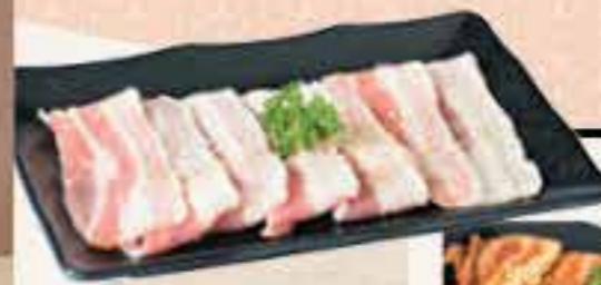
Pork Kalbi £9 • £7 HH Shio / Miso