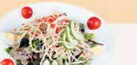
Kintan Salad £5 • £3 HH