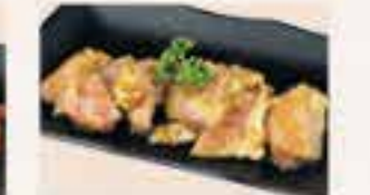
Chicken Basil £7 • £5 HH