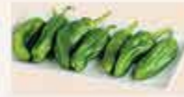
Padrón Peppers £4 • £3 HH