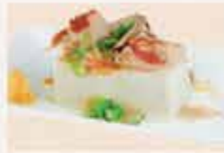
Hiyayakko Cold Tofu £5 • £4 HH