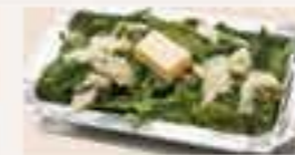
Garlic Spinach £5 • £4 HH