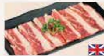
Toro Beef £8 • £7 HH Sweet Soy / Shio