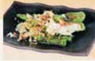
Sautéed Spanish Shishito £7 • £5 HH