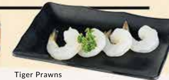
Tiger Prawns £9 • £7 HH Garlic / Basil